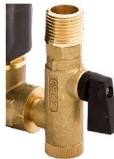
Filter Ball Valve