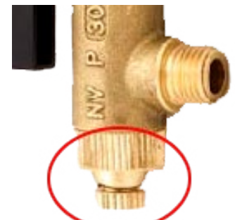
FBV fitted with Vented Cap Nut