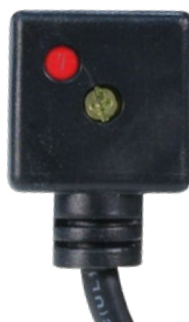
Illuminated Power Lead