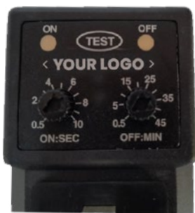
Private labeling including customer logo and colors

Along with our standard product configuration, we also offer an extensive range of customizable options to suit your needs. These include the following: