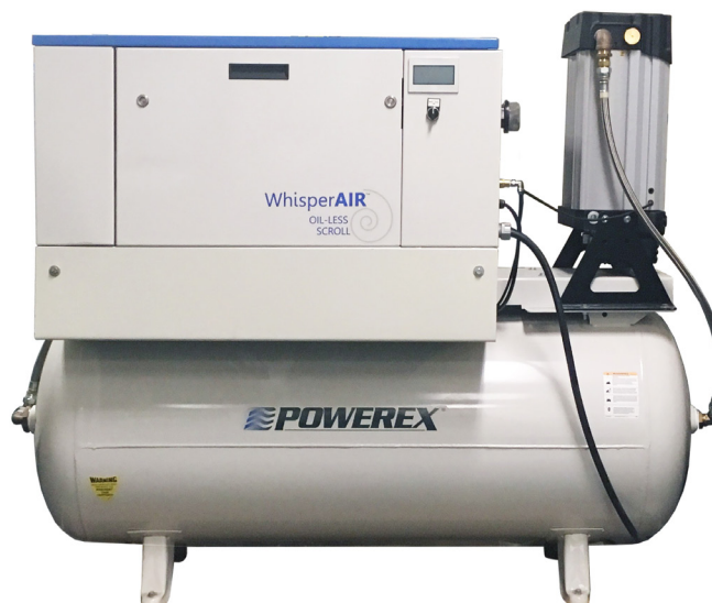
Simplex configuration with installed desiccant dryer