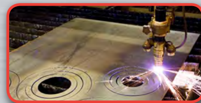
Cutting Tools Industry